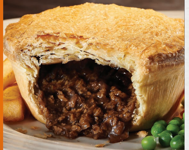
VEGAN MINCED STEAK & ONION PIE

The Grocer New Product Awards 2021 WINNER